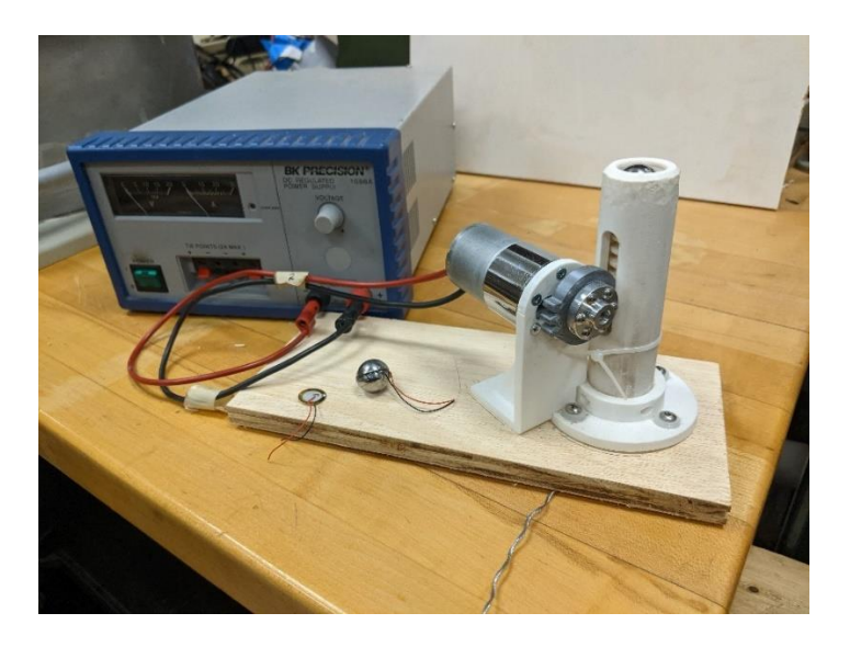
Figure 1. Rack and sector gear pinion steel ball tapper mechanism