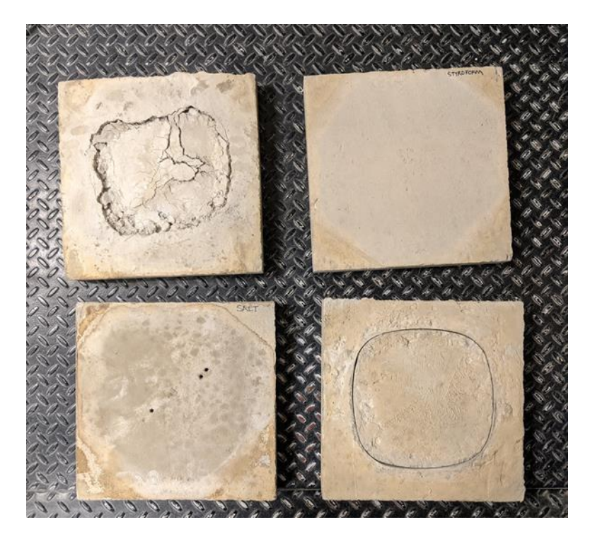
Figure 4. Concrete slabs with various forms of cast in place damage for laboratory testing.

Describe any additional activities involving the dissemination of research results not listed above under the following headings: