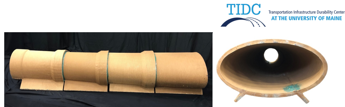
Figure 4: Side view and end view of assembled 3D printed culvert diffuser

The 3D printed culvert diffuser was picked up from the ASCC at UMaine by MaineDOT personnel and transported to the site in a pickup track on 12-11-2020. The 3D printed culvert diffuser prototype is scheduled to be installed by MaineDOT at a demonstration site in Thorndike, Maine during the Summer of 2012 to assess the hydraulic performance. In addition, the durability of the bio-based 3D printed composite material and the urethane adhesive under service conditions of the culvert diffuser will be monitored at the site.