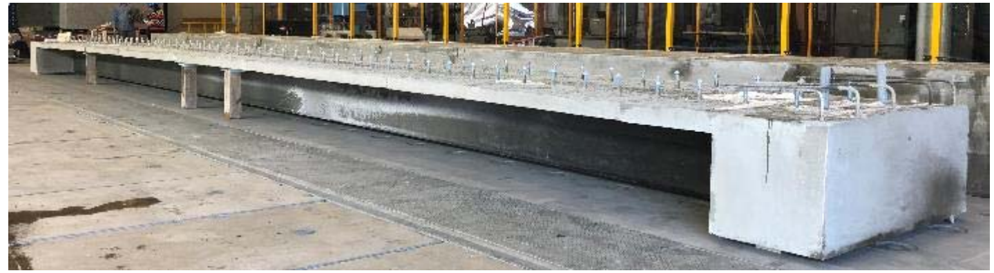
Staged Strength Testing Girder Specimen