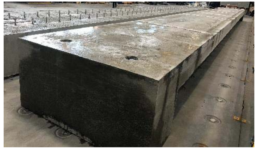
Creep Testing Girder Specimen